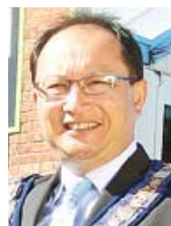
Meng Foon Mayor

You will see that the increase in rates revenue is less than was forecast for 2010/11 in the Ten Year Plan. Outside Gisborne city our modelling shows that rates will decrease in Ruatoria and that most other areas will have an increase of up to around 4.5%. The average city residential increase is 7.2%. Over half of this increase is due to the new wastewater treatment project. We are still hopeful that the increase can be reduced with the Government's help.