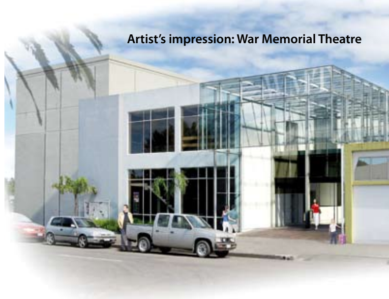
Artist's impression: War Memorial Theatre

Check out www.gdc.govt.nz or contact Customer Services if you would like to see the full proposed plan.