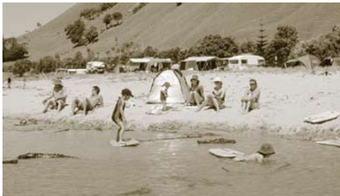
Above: Turihaua Lagoon is popular with children and is monitored by the Gisborne District Council during the summer months.

In 2005 a non-complying sample was collected at Waikanae Beach after a rain event, when increased stormwater runoff flushes bacteria and contaminants into water. This result is unsurprising, and consistent with what we have observed in previous years.