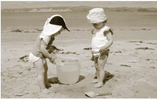
Above: Kaiti Beach - one of Gisborne's popular city beaches - complied with bathing water guidelines throughout 05-06.

The apparently poor results for Tolaga Bay wharf are a consequence of the low sampling frequency during this reporting period, and are misleading. The southern end of Kaiti Beach recorded non-complying results due to frequent rainfall through out 2005 and 2006. Results for Wherowhero Lagoon are consistent with previous years: adjacent farming is intensive and there are two streams entering the lagoon. These are the probable sources of contamination.