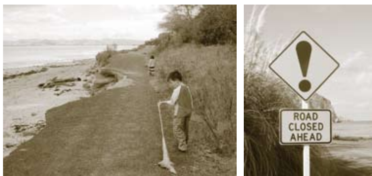
Above: The sea has undermined the far end of Kaiti Beach Road, and this section is permanently closed.

At-risk are natural fore-dunes on erosion-prone stretches of coast, and the existing beach protection works at Wainui.