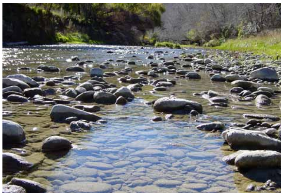
Above: River flows were very low, and very clear, over summer 2007 – 08.

Commencing in summer 2008, email communication was set up with water-permit holders in three catchments. Fortnightly low-flow gauging data were plotted on a rating curve and emailed to the permit holders. This gave users up-to-date flow information to assist with planning irrigation, and an overall view of river fluctuation over the entire summer irrigation season. Feedback from users was very positive, and this system will be continued.