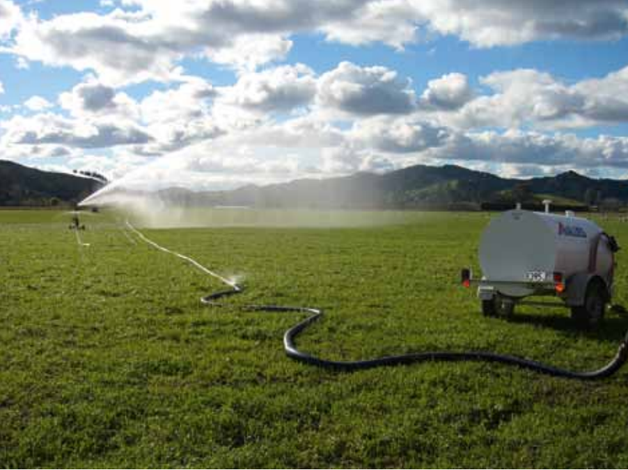
Above: Irrigation of pasture, seldom seen in Gisborne District, became a fairly common sight over the very dry summer of 2007 – 2008.