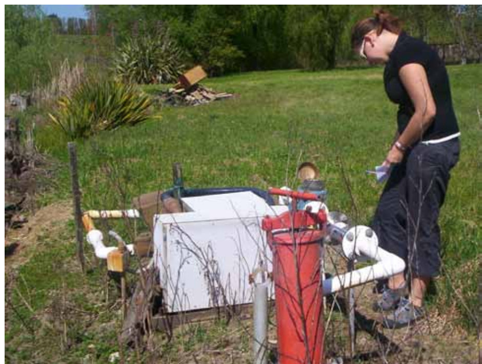
Above: GDC staff member taking a water-meter reading.