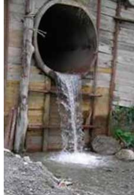
Above: Culverts with a 'drop' such as this prevent fish passage.

It is a legal requirement for structures placed in waterways after 1984 to allow for fish passage. Guidelines are available from both the Gisborne District Council and DoC. The Biodiversity Condition and Advice Fund may be available to assist private landowners wishing to enhance fish passage on private property. Criteria are available at www.biodiversity.govt.nz