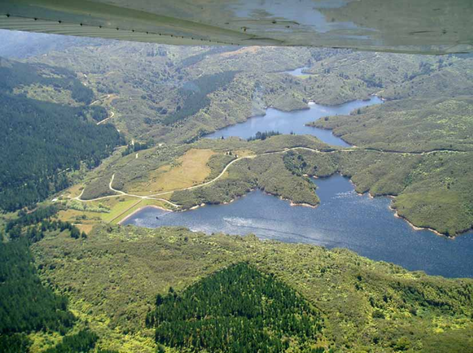
Above: Mangapoike Dams from the air.

How does Gisborne District Council continuously collect a wide variety of environmental data simultaneously across far-flung localities the length and breadth of the District?