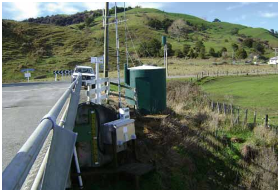
Above: Kanakanaia telemetry station, which records data on the Waipaoa River.

“Hilltop” software was chosen, as it will enable all the various environmental data that has been previously collected and stored in a range of software systems to be managed by one