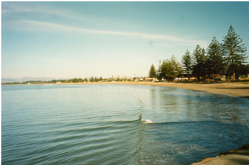
PHOTO 1 : Waikanae Beach Adjacent to the Waikanae Cut Looking Westward Towards Midway Beach