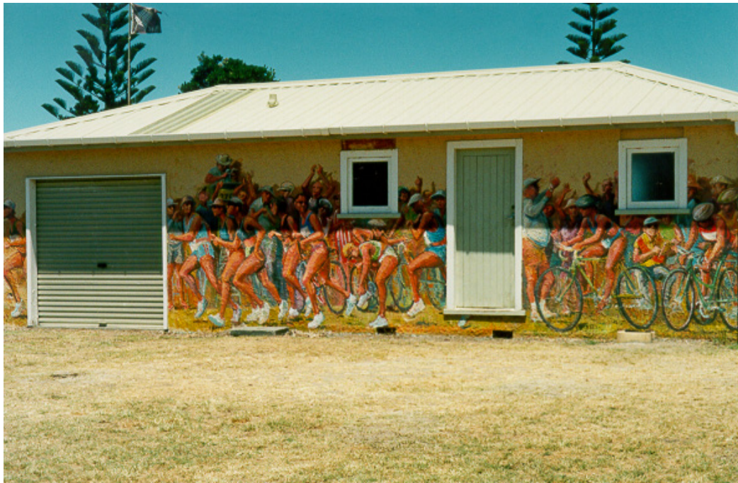
PHOTO 5 : The Gisborne Tri Club Building. This Building Occupies a Portion of the Beacon Street Reserve Adjacent to the Blue Pacific Motels.