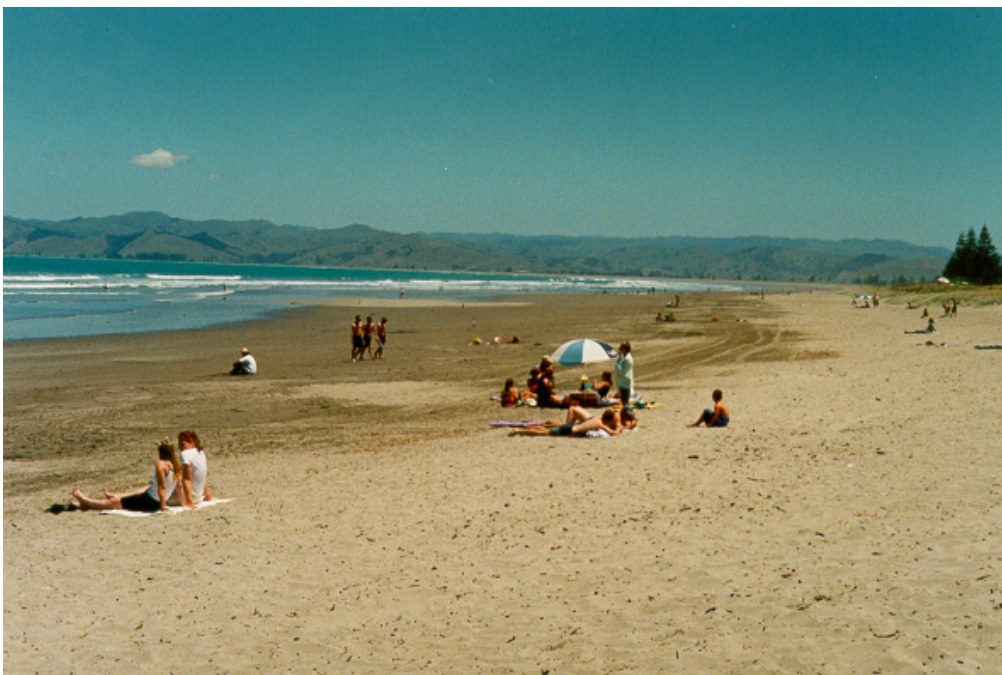
PHOTO 4 : Midway Beach - Beach Grooming Works (October-April). Assist in Maintaining this Portion of the Beach Frontage from Pacific Street through to the Waikanae Cut