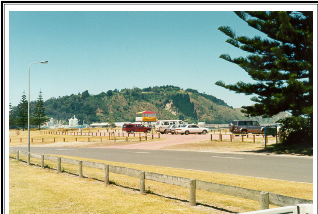
PHOTO 3 : Beacon Reserve Carpark and Picnic Area. Photo taken from Churchill Park