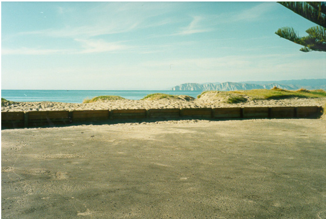
With the Completion of this Management Plan a Working Group will be Established Specifically to Address Dune Care Issues.