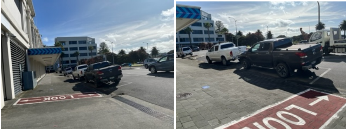
Proposed 3 rd and 4 th carpark spaces requested for Police only use