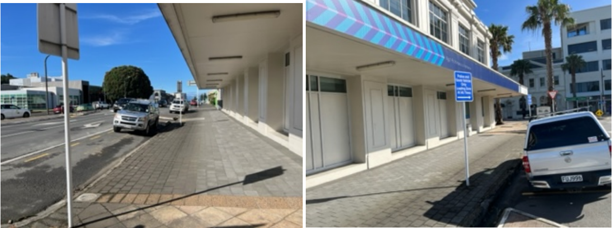
Current parking spaces on Customhouse Street showing signage for current two parking spaces