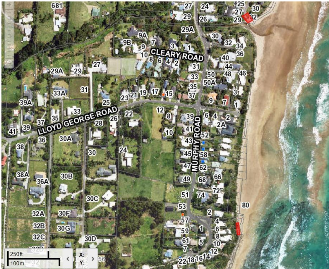
Figure 2 Tuahine Crescent work site approximately 400 metres south of Pare Street beach access