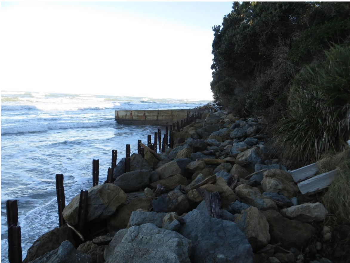
Figure 5 Tuhine Crescent 26 June 201