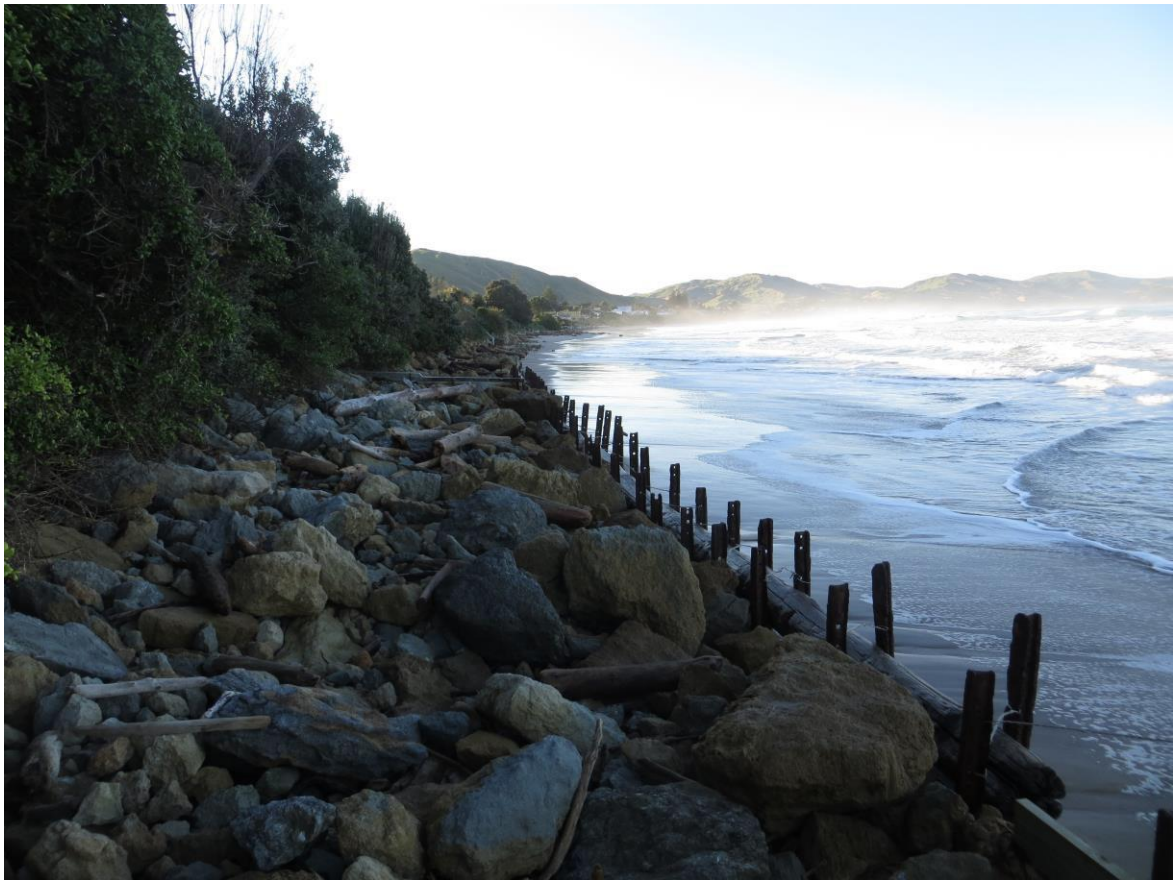
Figure 4 Tuhine Crescent 26 June 2015