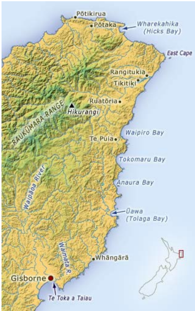
Table 2 - Ngati Porou geographical area - Te Puni Kokiri