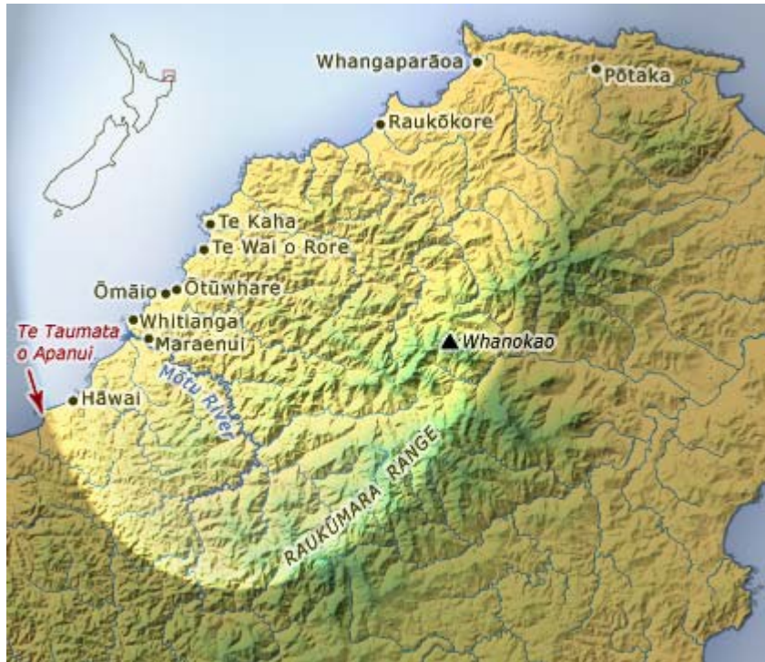
Table 3 - Te Whanau a Apanui geographical area - Te Puni Kokiri