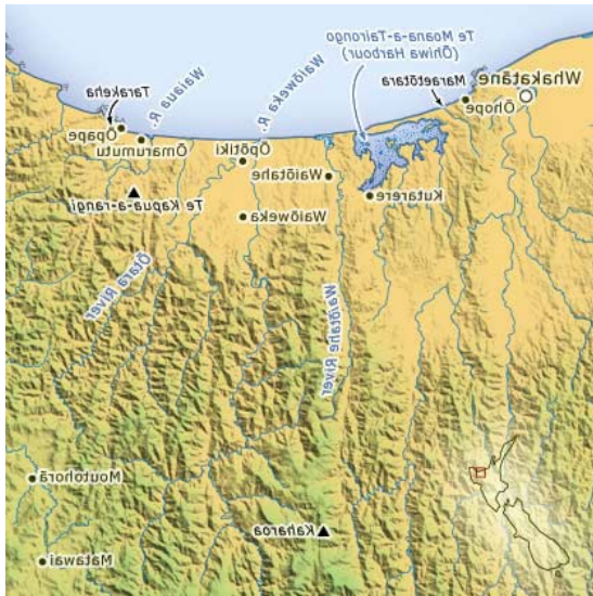
Table 5 - Te Whakatohea geographical area - Te Puni Kokiri