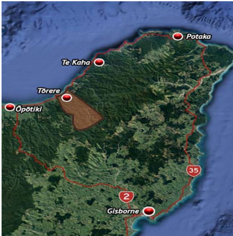
Table 4 - Ngai Tai ki Torere geographical area - Te Puni Kokiri