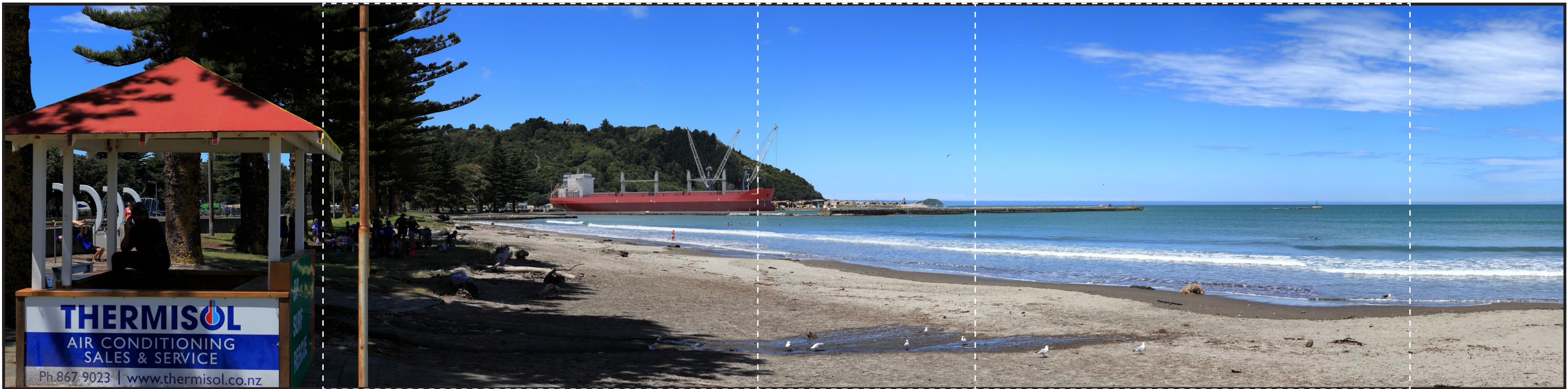
Viewpoint 03 - Permitted - High Tide - 10 February 2022 13:42pm