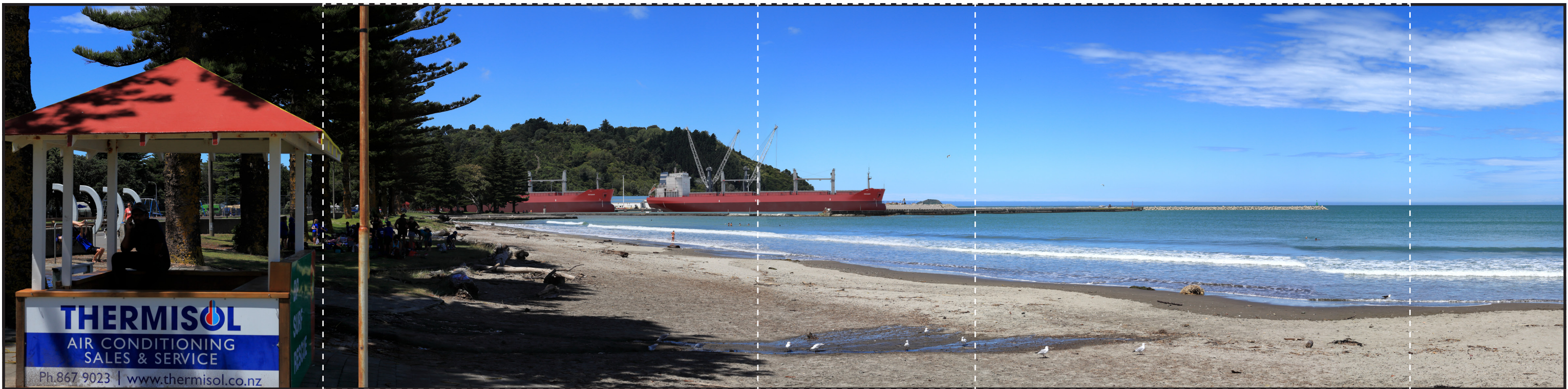
Viewpoint 03 - Proposed - High Tide - 10 February 2022 13:42pm