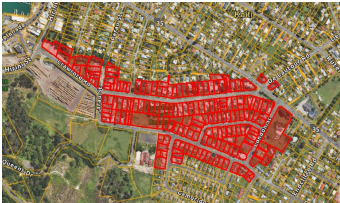
Figure 2: Map of those properties served a letter by MOE

The Minister of Education has undertaken consultation with potentially affected person/parties. These are identified in Figure 2 below.