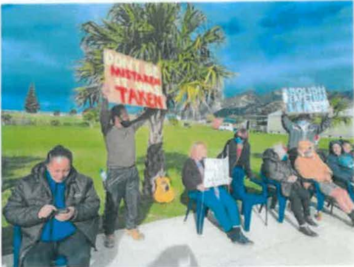
Tokomaru Bay Protest: End perpetual leases