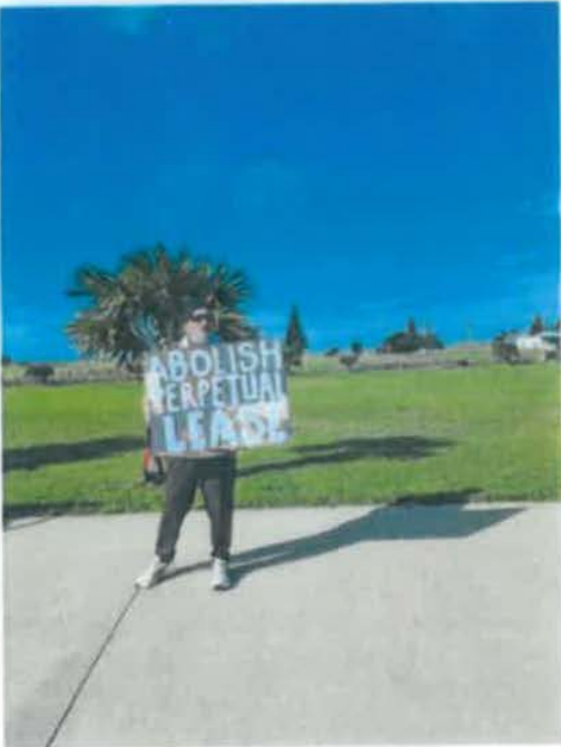
Abolish Perpetual leasing